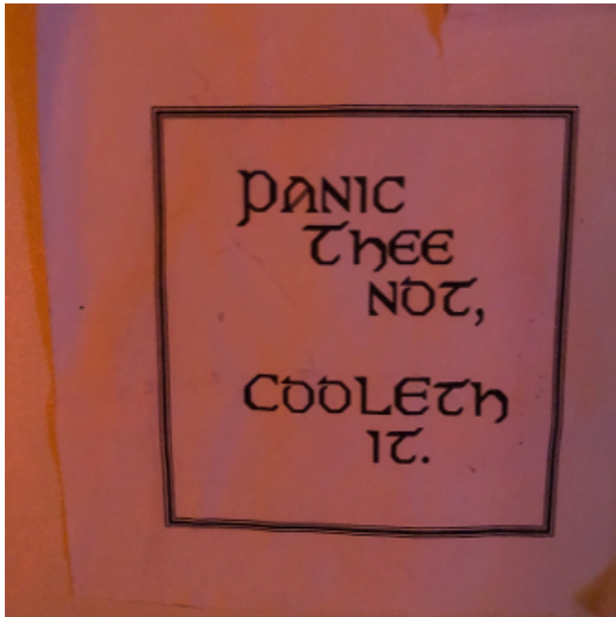
A kind piece of advice posted in the Altar Guild room